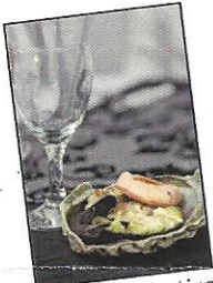
Seafood appetizer served in a shell

Sixty-three young adults attended a special buffet dinner at a tea garden in Ravensmead. They took creative photos in the garden and enjoyed traditional food. Most of them are surrounded by the unsaved at work and school, so these times together provide Christian fellowship. The young adults from our church worked together on some skits and then sang together before the message.