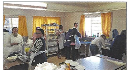
The ladies took turns helping to serve through cleanup in the kitchen.

Contact Info.: PO Box 765 · Kuilsriver 7579 · SOUTH AFRICA · Bill's cell: +27-714-720-188 · bknipe@gfamissions.org